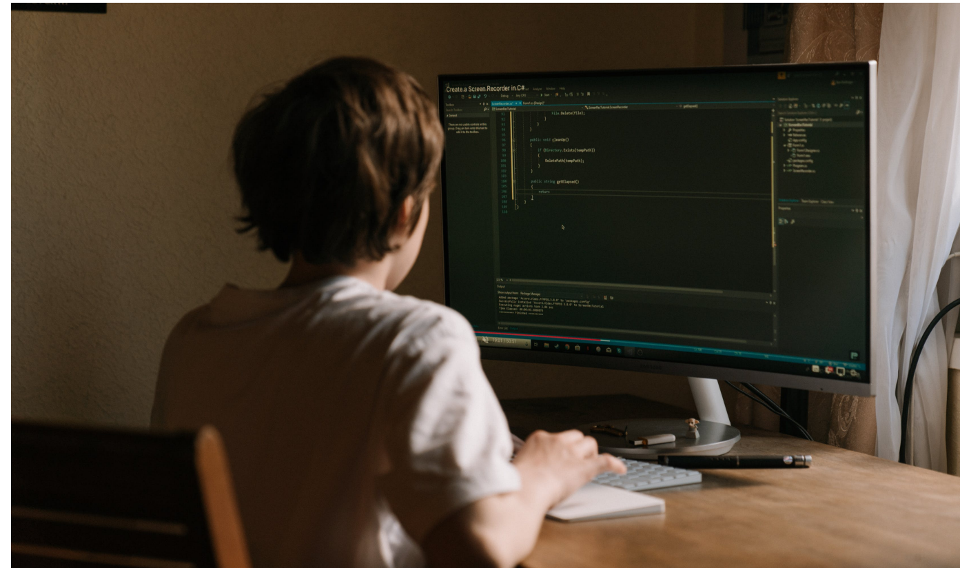
Developer / researcher