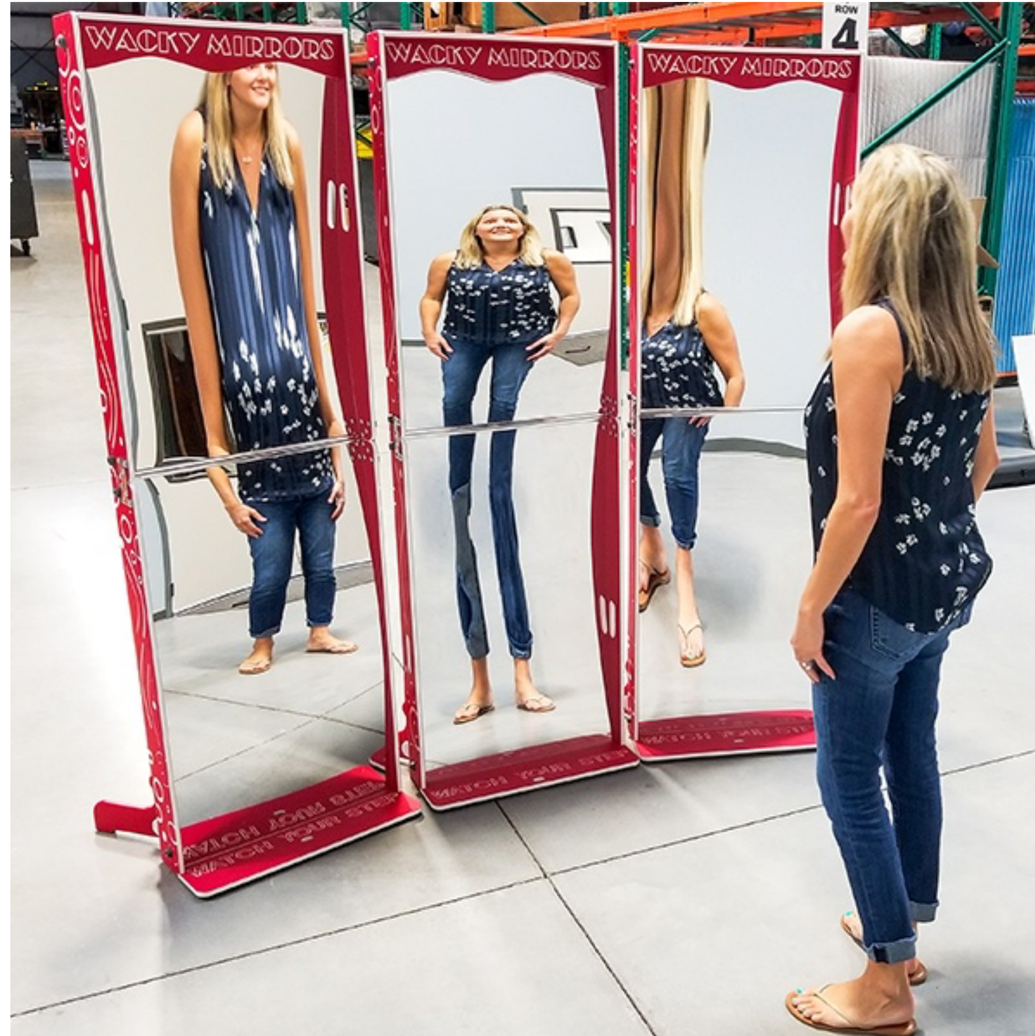
A person whose reflection is being distorted by mirrors.