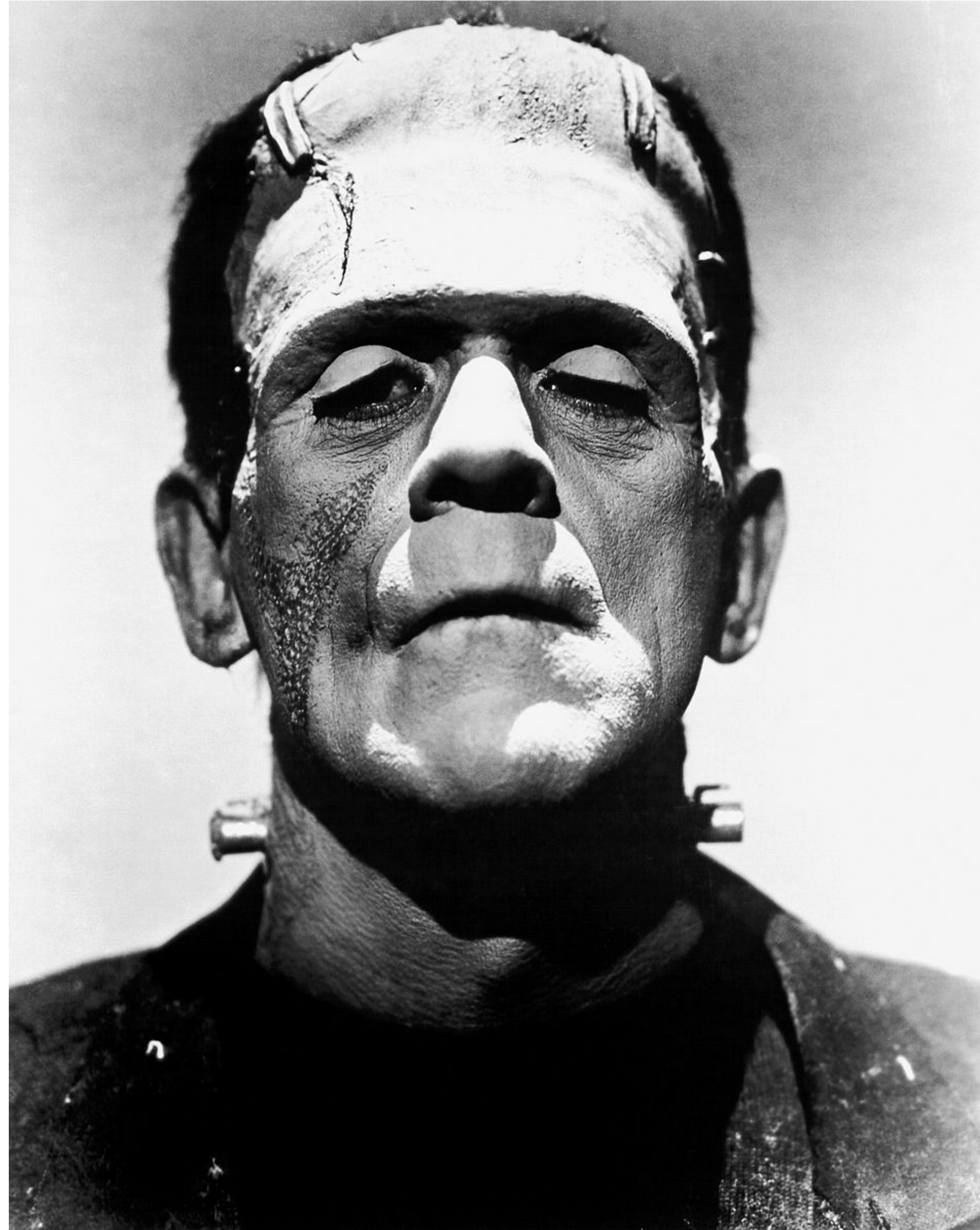
Boris Karloff as Frankenstein's Monster. Source: Frankenstein (1931)